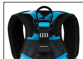
(Back Pad/D-Ring/SRL Connector)