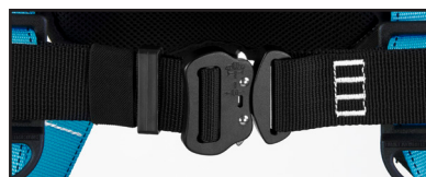
(Ultra Lightweight Aluminum Quick Release Chest Connector)