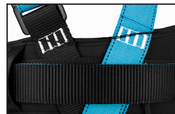
(Integrated Sewn-In Back Support System)